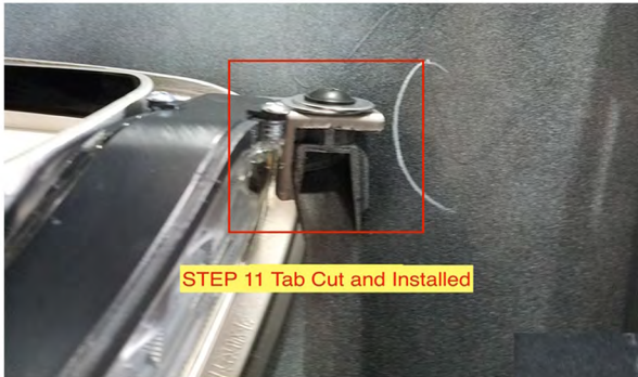
STEP 11 Tab Cut and Installed